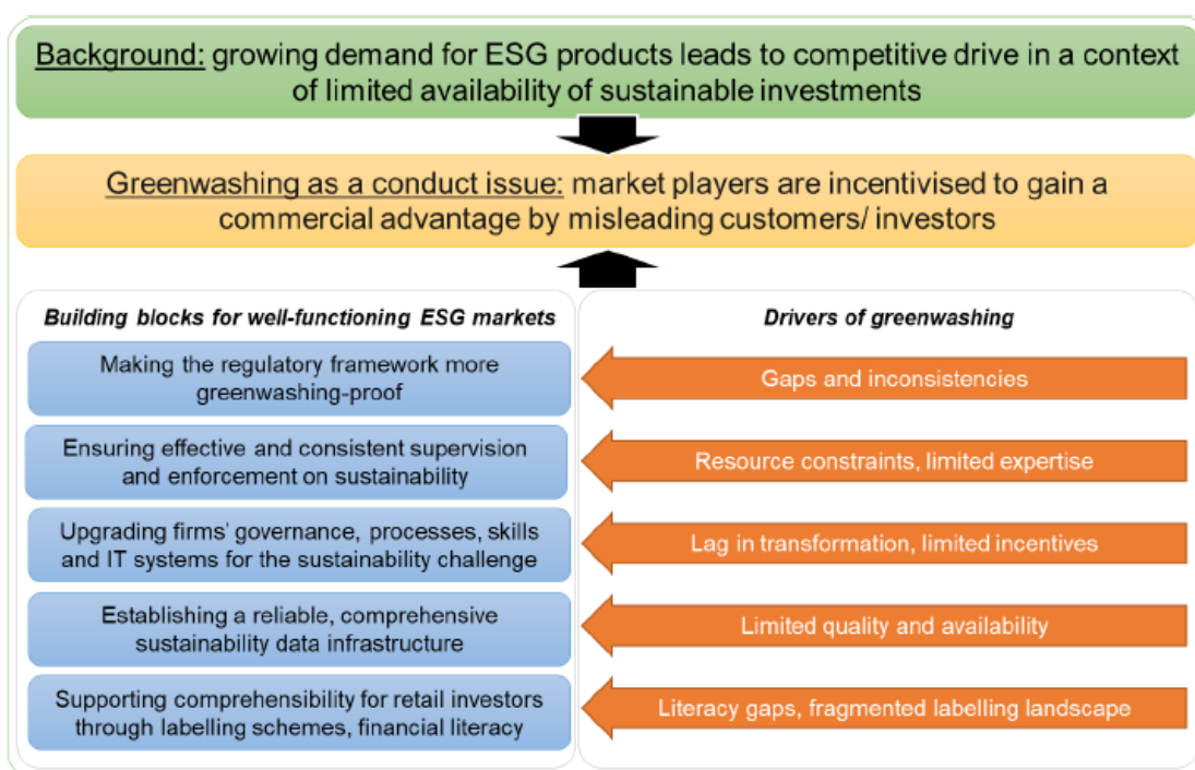
Figure 2: The multiple drivers of greenwashing risks

In their 2023 Progress Report on Greenwashing, ESMA noted that the competitive drive for market shares and revenue has led to both entity-level and product-level efforts at bolstering sustainability profiles. In a context of very low levels of Taxonomy-aligned assets, investment opportunities for which sustainability performance appears to be beyond doubt or disagreement are still scarce. In this context, greenwashing risk appears to be driven by the convergence of multiple factors (including market, regulatory, supervisory, data and methodological aspects) which may be aggravating conduct issues 17 .